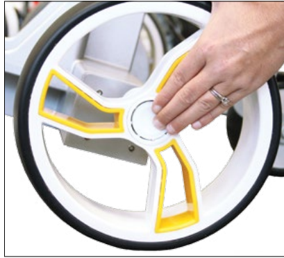
Push wheel release button.